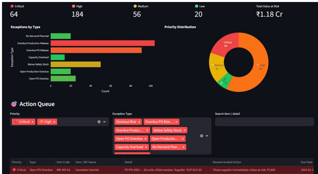
Exception Dashboard — Run these modules for complete exception coverage: MRP: ✓ | Capacity: ✓ | Forecast: ✓

Complete Inventory Analysis: ABC Classifications. Inventory turns. Dead & Slow movers. Value pyramid. Material availability. Cost Rollup. Scrap & Yield Analysis. Exception dashboard based on Inventory & Production data. Build What-if scenarios.