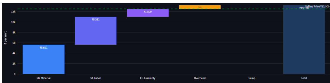
Cost Rollup — to redefine product price using current labor, material and overhead costs