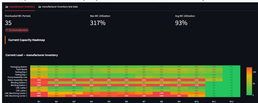
Capacity Heatmap – Balance work center capacity, overloaded work centers, max. & avg. utilization